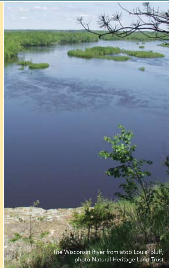
The Wisconsin River from atop Louis' Bluff