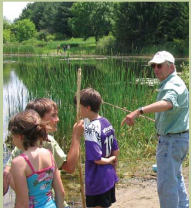
Families fishing on now-protected Camp/Quad.