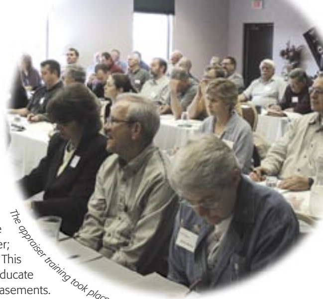
The appraiser training took place on May 20 in Wisconsin Dells.