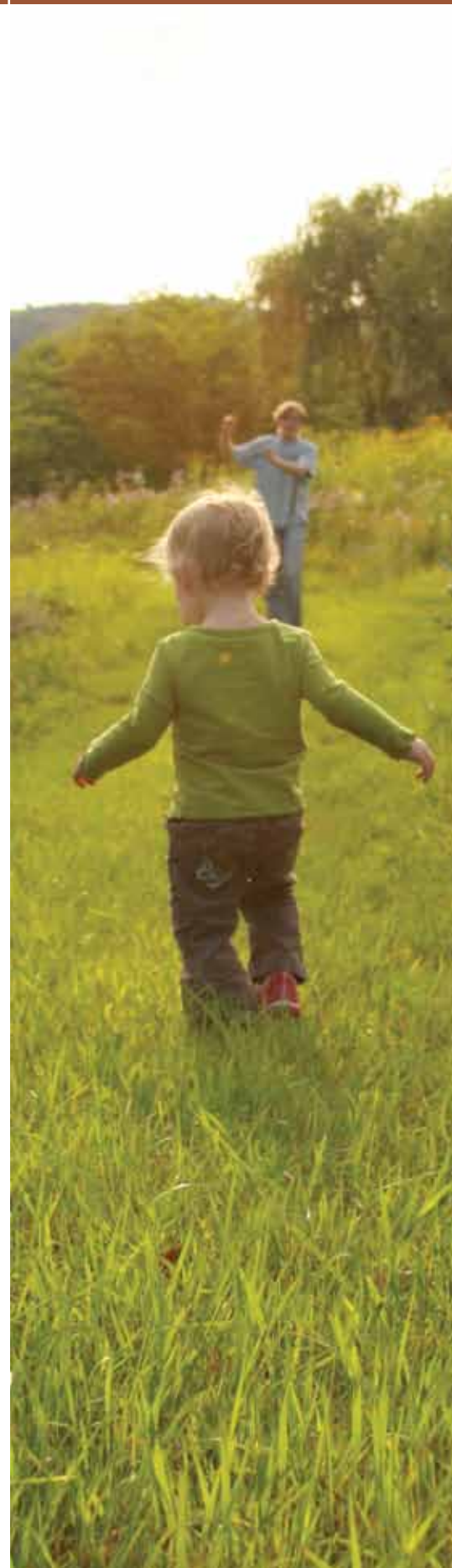
A Prairie Enthusiast conservation easement near Prairie du Chien.