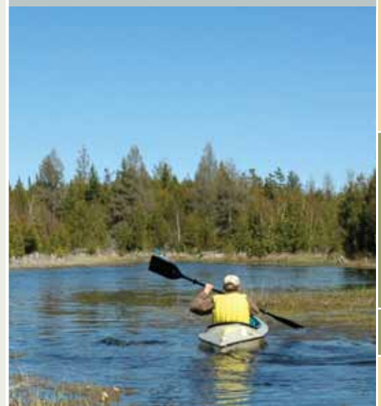
Three Springs Preserve, a project of the Door County Land Trust.

Thank you to the individuals and organizations who fulfilled pledge installments to our 3-year Stewardship Campaign in the 2009 fiscal year. All contributors are recognized in dark brown.