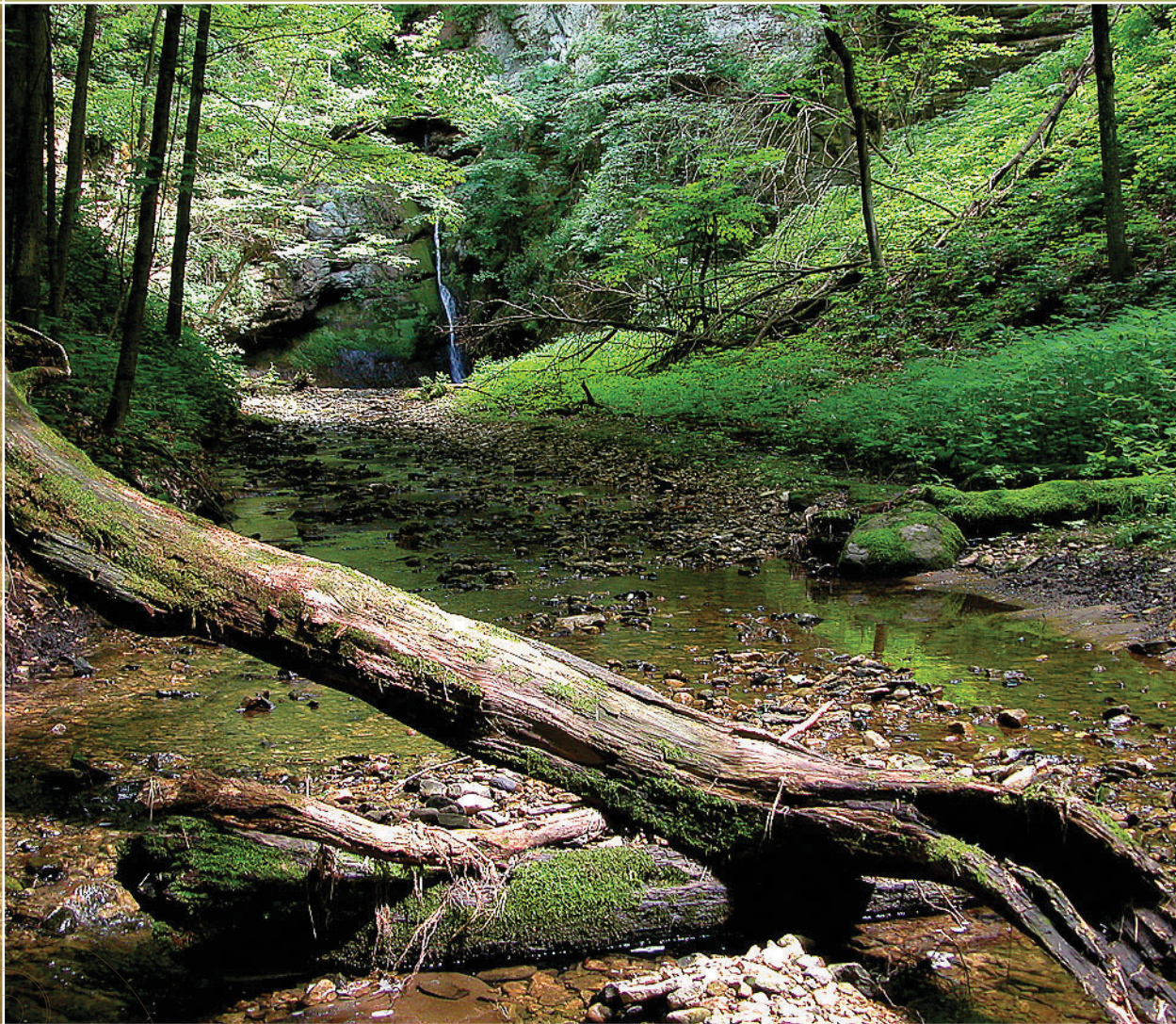
Mitchell Glenn