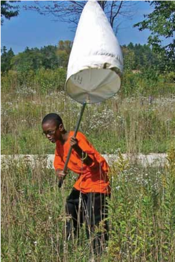
Milwaukee elementary school student discovering the insect residents of the Mequon Nature Preserve.

“Gathering Waters looks out for the big-picture issues (like Stewardship), and engages us strategically, so that we can concentrate on our local work but also participate in the broader issues that have a big impact on us.”