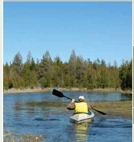
Three Springs Preserve, a project of the Door County Land Trust.

Thank you to the individuals and organizations who fulfilled pledge installments to our 3-year Stewardship Campaign in the 2009 fiscal year. All contributors are recognized in dark brown.