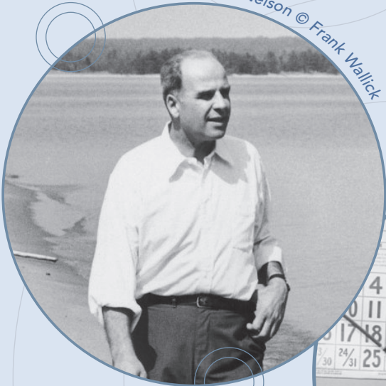
Gaylord Nelson

Nonprofit Org. U.S. Postage PAID Madison, WI Permit No. 669