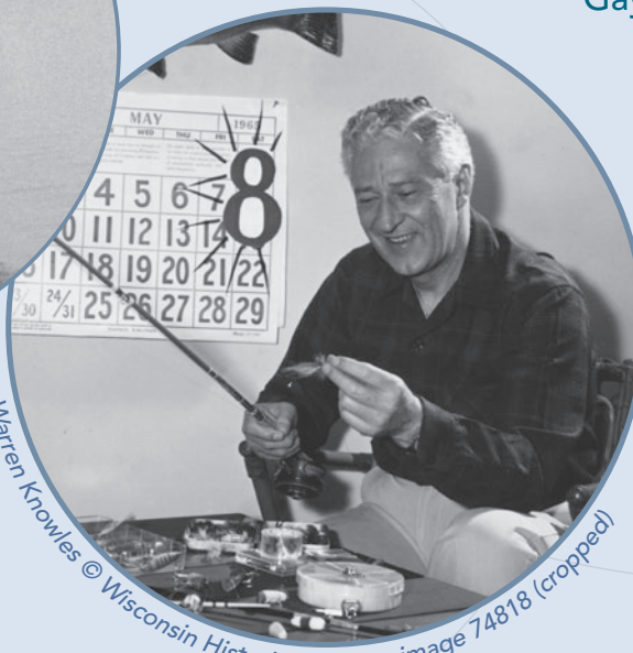
Warren Knowles

Warren Knowles, a Republican, and Gaylord Nelson, a Democrat, epitomized what can be accomplished when we all work together to protect Wisconsin's special places and most valuable community assets.