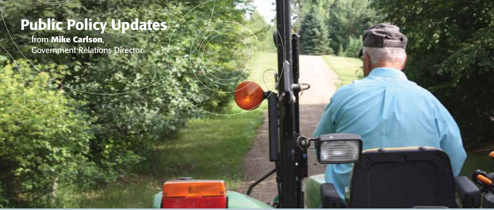
At work on a farm protected last year through a conservation easement donated to the Star Prairie Land Preservation Trust. Wisconsin's new PACE program will make conservation easements a viable option for many more family farms