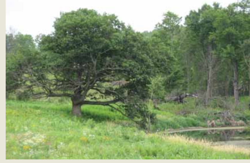
A pothole pond brought to you by the Standing Cedars Community Land Conservancy

Those acres keep them busy. This land trust secures grant funds to pay a property manager, but they spend many, many unpaid hours with a core of about 100 weed pulling, prairie planting, fence-repairing and trash-collecting volunteers. The Conservancy offers hunting privileges on its properties and, in exchange, hunters aid the Conservancy's efforts to