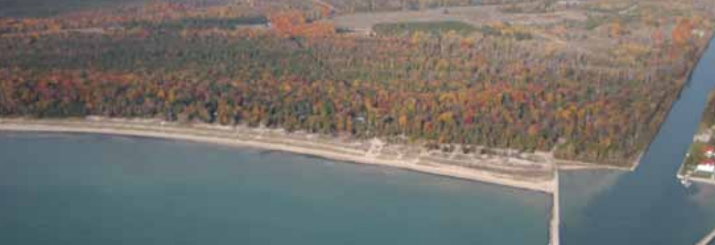
An aerial view of lands forever protected thanks to the Door County Land Trust and the Stewardship Fund.