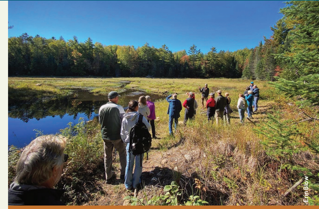
Invite your friends and have fun outside.

Fun family activities like horseback rides, a bouncy house, pumpkin decorating, kids crafts, live music, plus a pie sale, and potluck dinner.