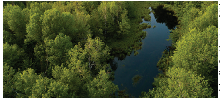
Pelican River Forest

And the opponents didn't stop there. They actively distributed misinformation to town