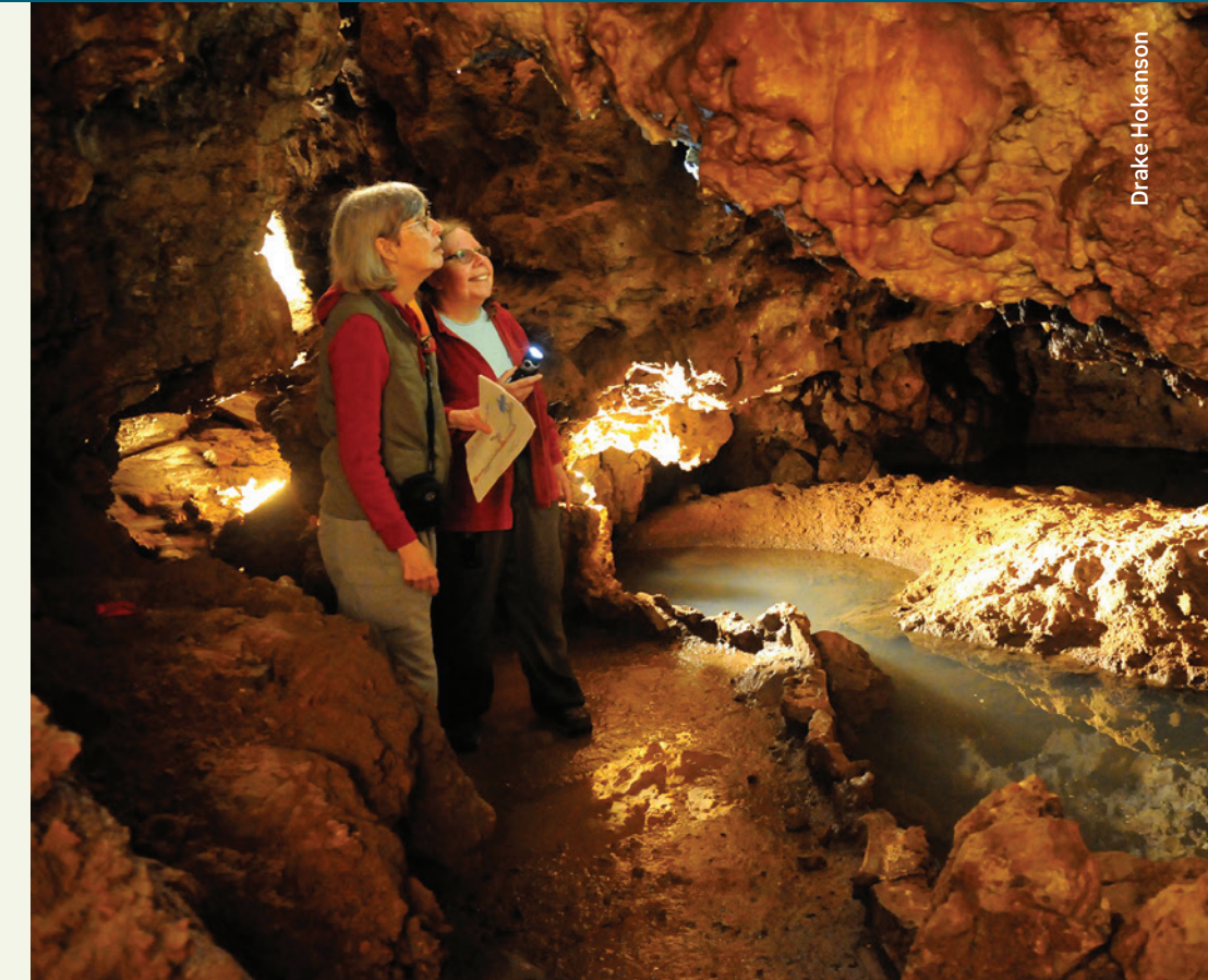
Mississippi Valley Conservancy's Kickapoo Caverns