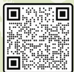
Trailbuilding with Ice Age Trail Alliance