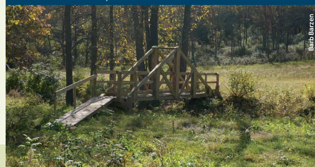
Driftless Trail — Land Trust Days Featured Destination

Let the autumn season inspire you. Make leaf art, pressed leaf collages, leaf rubbings, and leaf pounding prints.