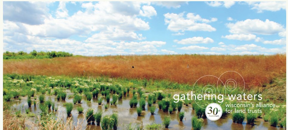
Pike River - Photo by Dan Giordano

There was also talk of eliminating state funding for land protection altogether. But a broad coalition effort ensured it continued.